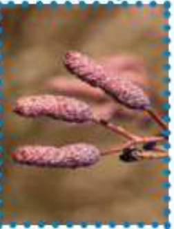
Mike Read (rspb-images.com)

Blossom grows on lots of trees. Sniff it to see if it smells of anything.