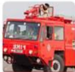
Fire Engine Rides