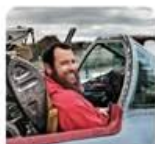
Climb in the Cockpits