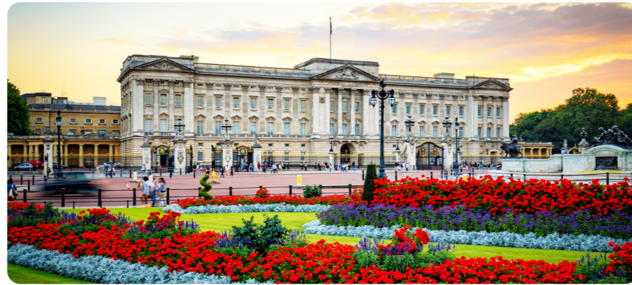
Buckingham Palace is in London, England.

Royal residences include palaces, castles and stately homes. Some of them are used for official royal business. Some are used as holiday or private homes. Many are tourist attractions.