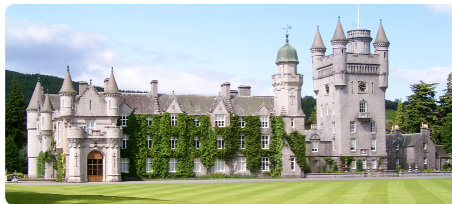
Balmoral Castle is in Aberdeenshire, Scotland.